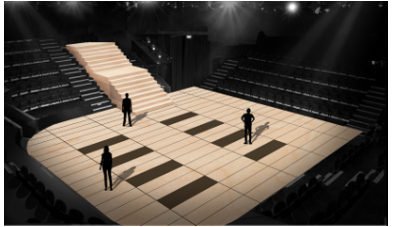
La Boite's Romeo and Juliet Set